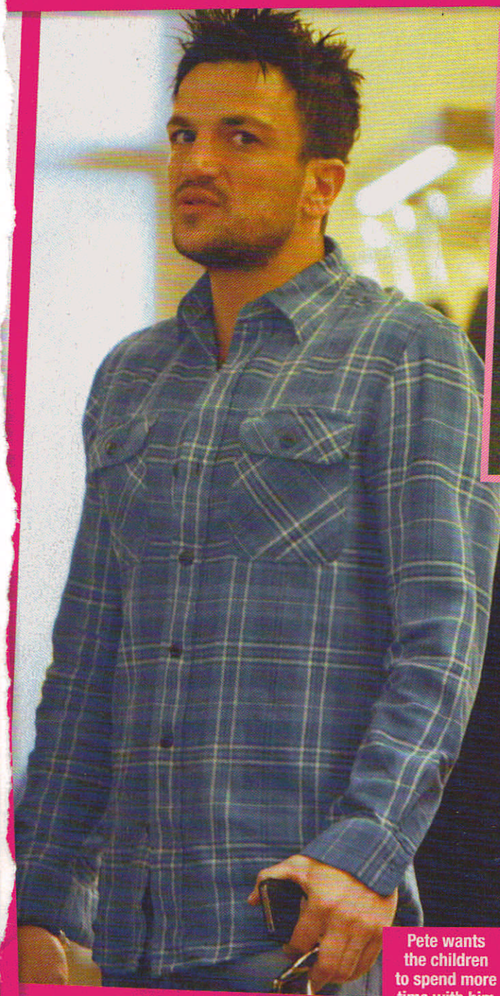
Pete wants the children to spend more time with him

Peter Andre is said to be livid over the latest row with ex-wife Jordan